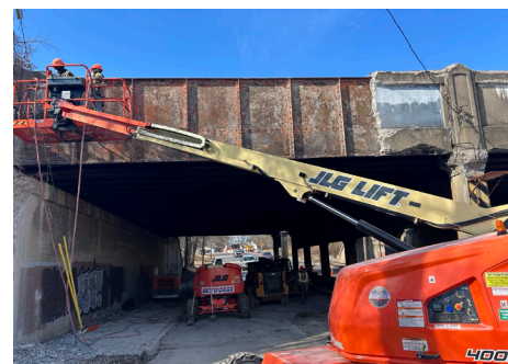
Bridge Repair - Brooklyn, OH