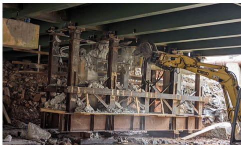
Bent 4 - Pier Cap Demolition