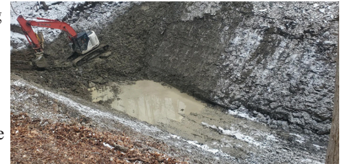
Excavation - Livonia, NY