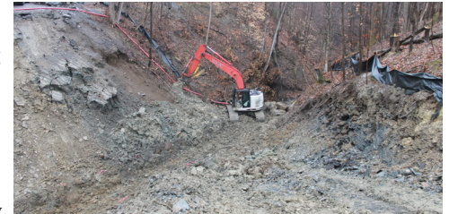
Blank Road Project - Livonia, NY