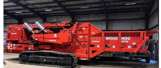
Wood Hog 6600