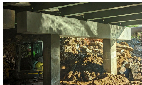
Bent 4 - New Cap