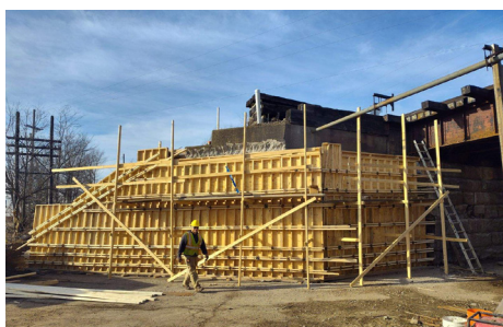
Bridge Replacement - Millersburg, IN

The railroad division has started the New Year off incredibly busy with multiple projects in progress and many more to get started. We have a large bearing project wrapping up in Wilkes-Barre, PA in the coming weeks as well as ongoing work in Cleveland Ohio, Millersburg Indiana, and Attica Indiana. We have 4 span replacements to complete in 2024 and many bridge repair projects as well. The bidding schedule is busy as ever and doesn’t seem to be slowing down any time soon. The dedication and ambition the railroad division employs is second to none. I have no doubts that we will navigate 2024 with unmatched success and productivity. “Productivity is never an accident. It is always the result of a commitment to excellence, intelligent planning, and focused effort.” – Paul J. Meyer