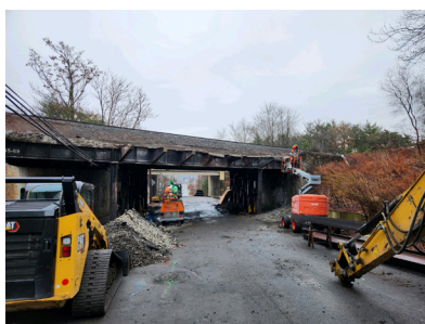
Emergency Repair - Scranton, PA