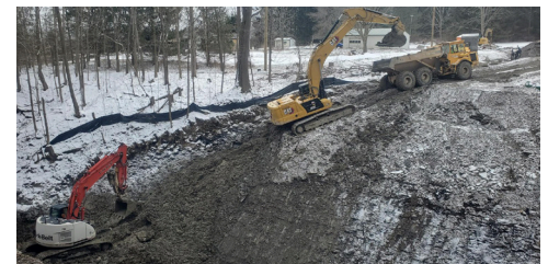
Load Number 620 Being Removed