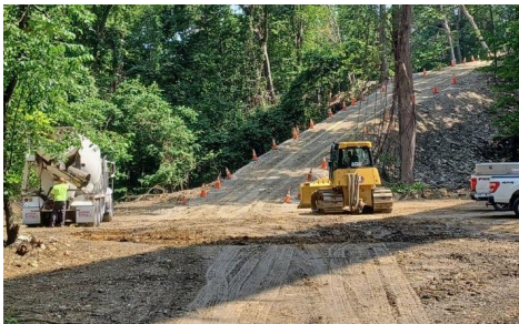
Part Of The 1000' Access Road