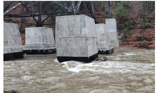
6 Of The 8 Pedestals That Were Encased In Concrete