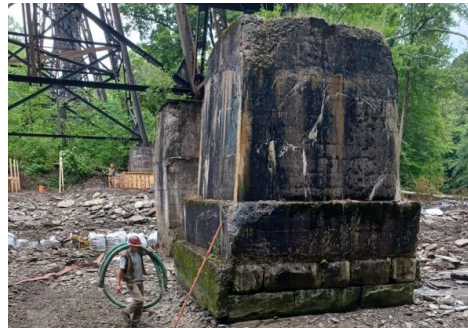
One Of The Existing Pedestals That Were Encased In Concrete