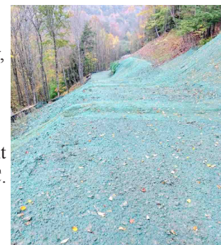
Henckle Hill ROW Restoration