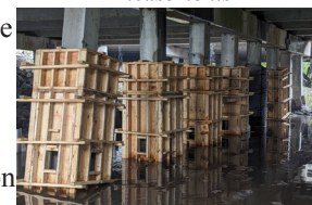
Project #23070 – Pile Encasements Forms