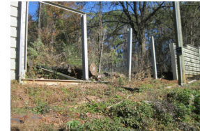
Project #23096 – Typical Repair Site