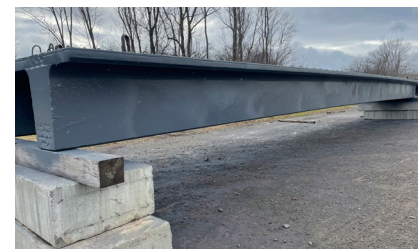
Next Beams NYSDOT Westchester County, NY