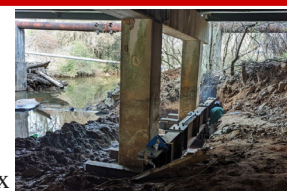
Project #23002 – Falsework Begun

We have greatly benefited from a strong Georgia economy and emphasis on improving our transportation infrastructure. LCW just received the award confirmation of another large GDOT bridge rehabilitation project near Savannah, GA. We have recently been blessed with a heavy backlog of future work; our current projected schedule continues until the end of 2025. We look forward to utilizing this great growth opportunity ahead to add more good people to our Georgia team.