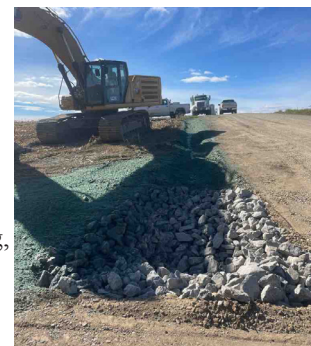
Access Road & Ditch Repairs