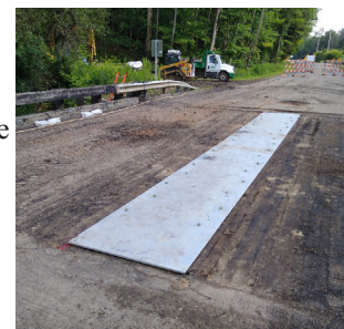
Steuben County Bridge Repair

We’ve completed all the work contracted to us and look forward to more work come spring to wrap up the project.