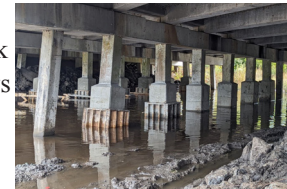
Project #23070 – Tidal Pile Encasements