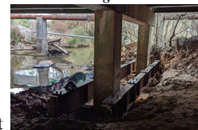
Project #23002 – Falsework Bases