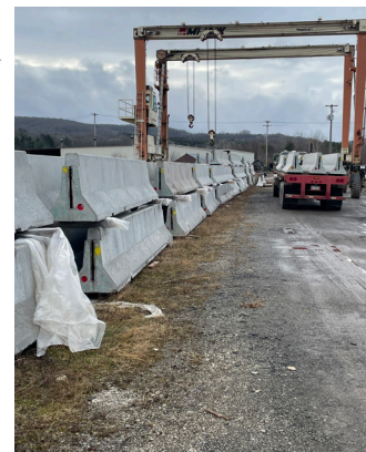
NYSDOT 20' Barrier

Next year looks very promising and with a heavy forecast of potential work. We are going in to next year with a positive attitude to have a profitable season in producing and delivering beams. Thanks to all who have worked hard throughout the year and keep up the good work!