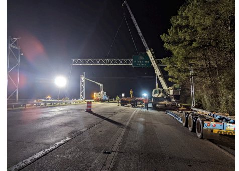
Project #21053 – Signing Upgrades