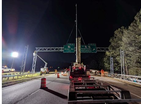
Project #21053 – Signing Upgrades