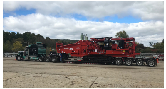
Morbark 6400XT (Delivery)