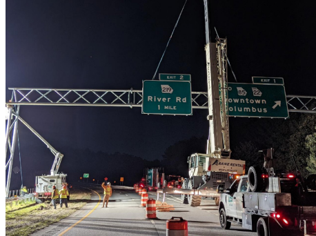
Project #21053 – Signing Upgrades