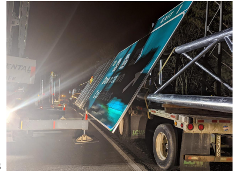
Project #21053 – Signing Upgrades