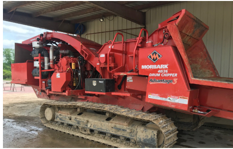
Morbark 4036 Track Chipper