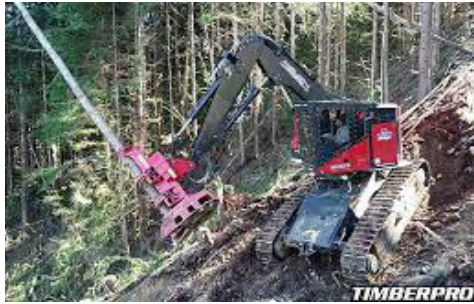
Timpro TL735D Feller-Buncher

In the 4th Quarter we have sold a new Morbark 6400XT Track Horizontal Grinder, a new Morbark 40/36 Track Chipper and a new TimberPro TL735D Feller-Buncher. 2023 looks to be a good year as well. We have lots of customer interest with the only problem being equipment availability. Supply chain issues are still causing long lead times for new orders. We ordered 6 new machines in October and they are not going to arrive until next fall.