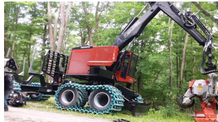
TimberPro TF830D Forwarder