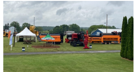
Pennsylvania Timber Show