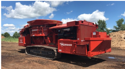
Morbark 1300B Tracked Tub Grinder

We also had a booth at the PA TimberShow in State College, PA. We had a nice display of new Morbark and Doppstadt equipment to show our customers. We also were able to deliver a brand new TimberPro TL735D Feller Buncher from our booth to A.M. Logging. This was the 12th new TimberPro they have purchased from LCW!